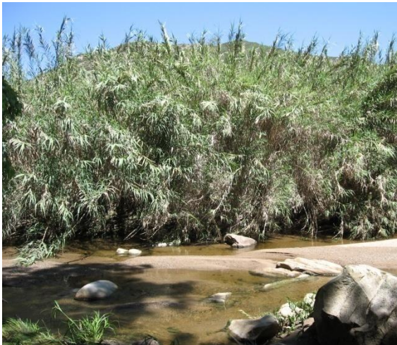
Giant reed in its preferred habitat