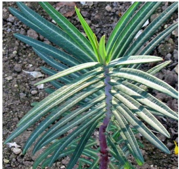
Caper spurge ( Euphorbia lathyris )