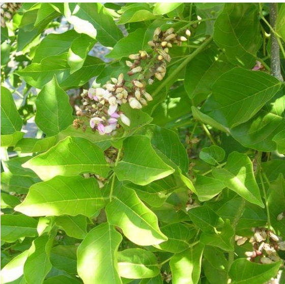
Pongamia ( Milletia pinnata )