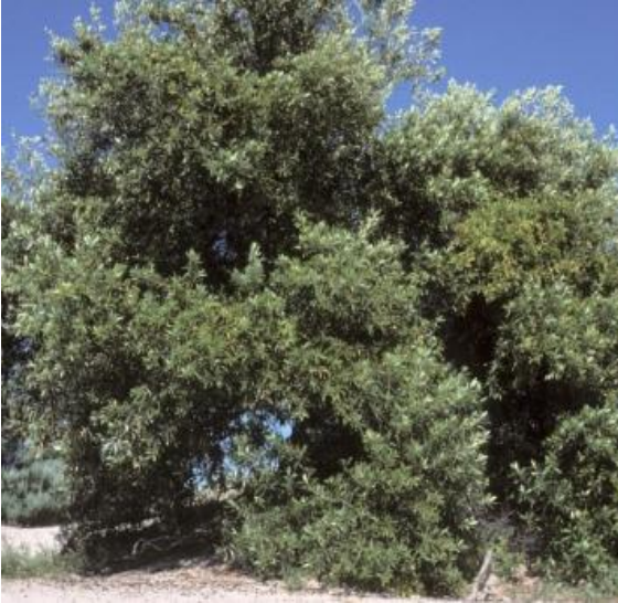
Olive ( Olea europaea ) near Adelaide