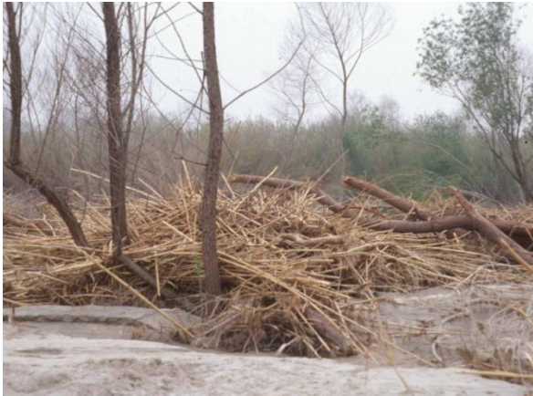
Giant reed flood debris in California