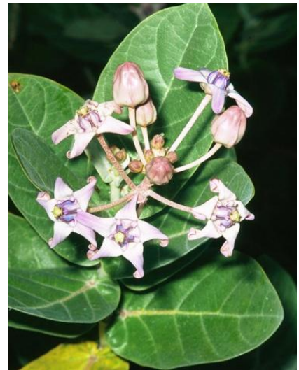
Giant milkweed ( Calotropis gigantea )