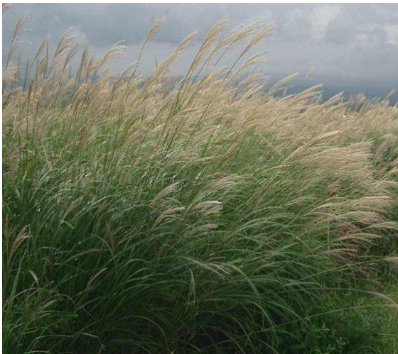
Miscanthus ( Miscanthus sinensis )