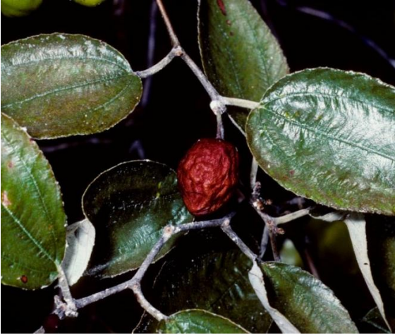
Chinee apple ( Zizyphus mauritiana )