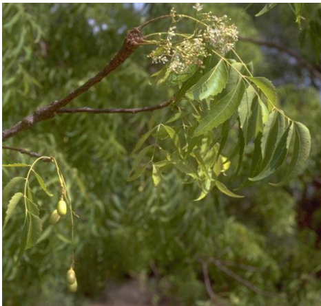
Neem tree ( Azadirachta indica )