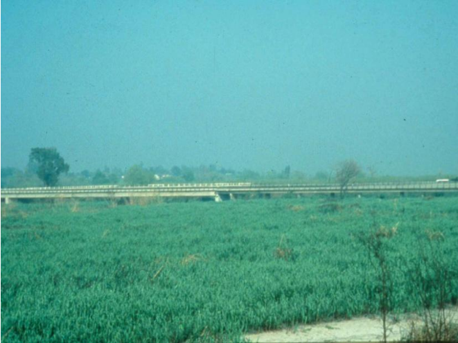
Giant reed ( Arundo donax ) invasion in California