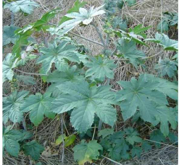
Castor oil plant ( Ricinis communis )