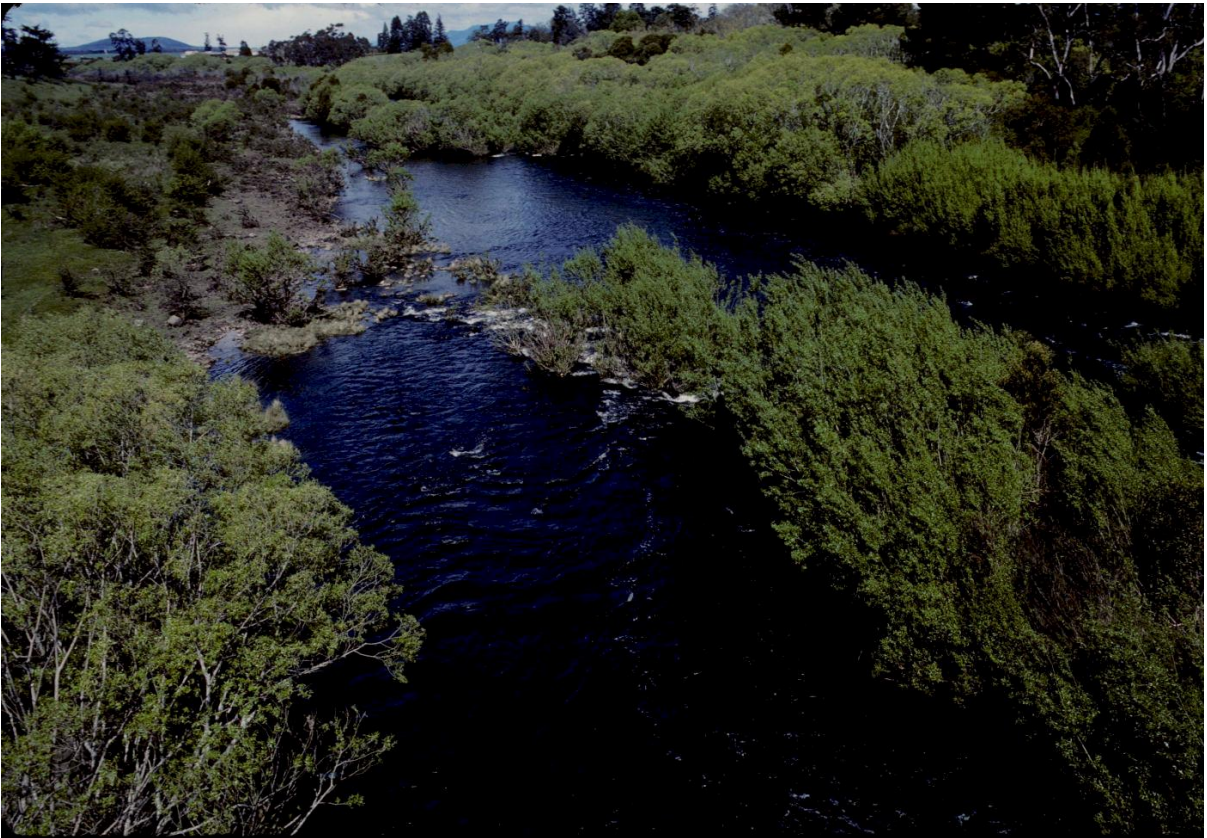
Willows ( Salix ) near Perth, Tasmania, completely dominating the river environment