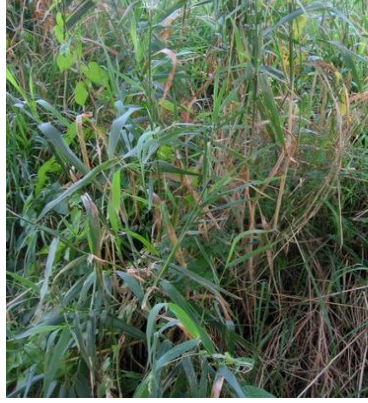
Reed canary grass ( Phalaris arundinacea )