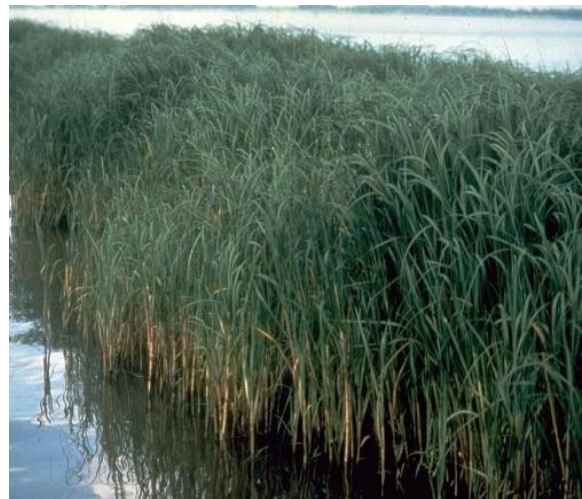
Spartina ( Spartina alterniflora )