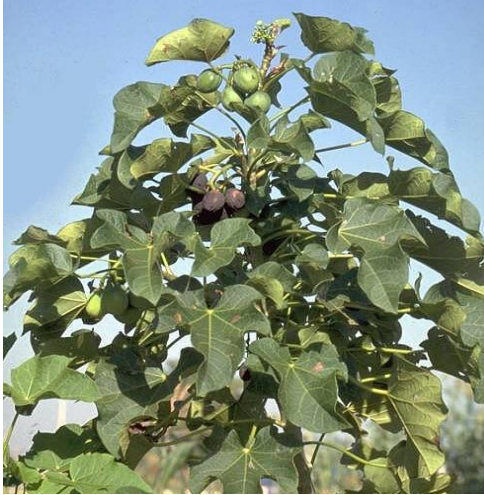
Jatropha ( Jatropha curcas )