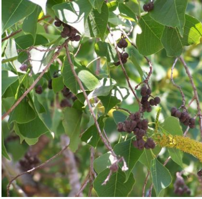
Chinese tallow ( Triadica sebifera )