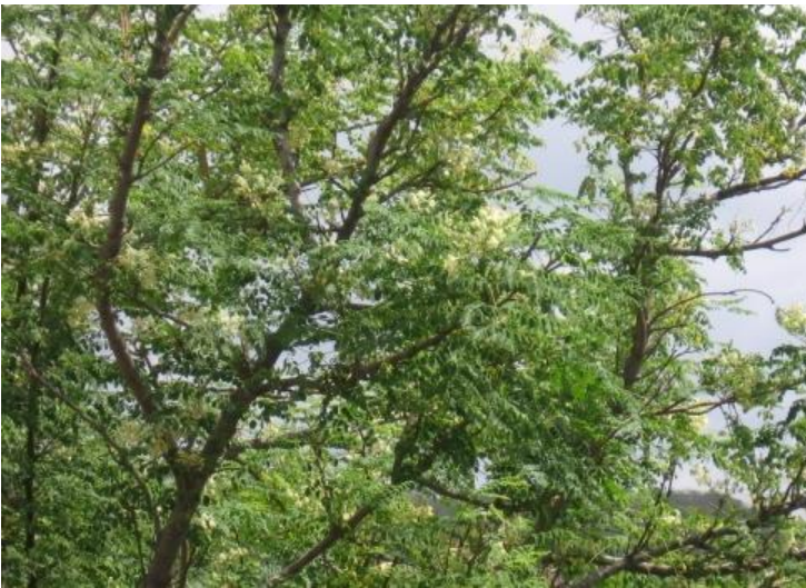
Moringa ( Moringa pterygosperma )