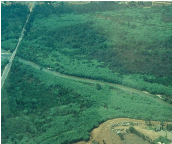
Aerial view of giant reed invasion in California