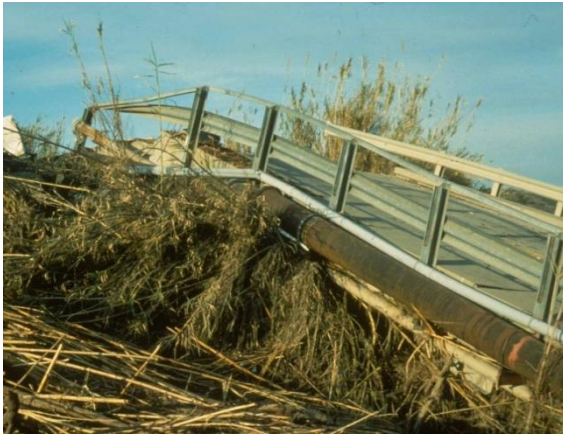
Californian bridge damaged by reed debris