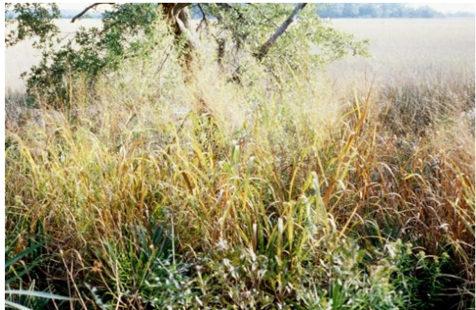
Switch grass ( Panicum virgatum )