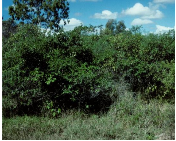
Chinee apple thicket near Charters Towers