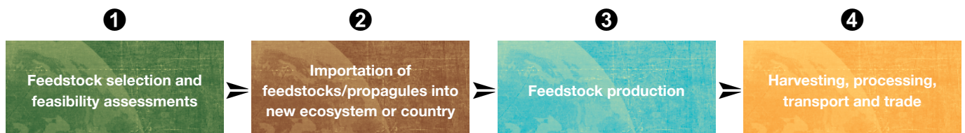
Figure 2 – Simplified supply chain showing potential intervention points

For the purpose of these guidelines, the biofuels supply chain has been divided into four stages: 1) selecting the biofuel feedstock and plantation site, 2) moving the feedstock to site, 3) production, and 4) harvest, transport, processing into biofuels, and transport to the point of sale. At each of these stages there are specific risks and options for avoiding or managing the risk of an invasion which may therefore require different interventions.