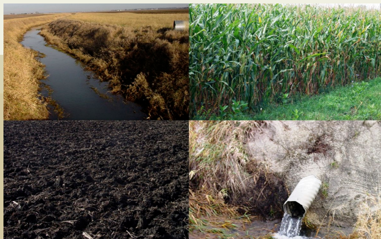
Figure 4. Because of a shallow rooting system and short time period of active nutrient uptake, corn is a crop that is particularly leaky of nutrients. In regions where soils have artificial drainage, the nitrogen loss associated with growing corn can be quite high. This is the single largest source of nutrient pollution leading to the “dead zone,” or area of low-oxygen water in the plume of the Mississippi River in the Gulf of Mexico.

harvest. Also during the cultivation phase, large amounts of polluting nitrogen gases are emitted to the atmosphere from volatilization of fertilizers and nitrogen-containing wastes (Chapters 10 and 16).