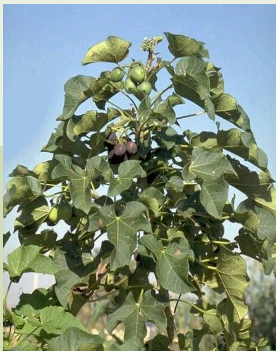
Figure 5. Oil from jatropha grown on degraded lands in Mali powers generators for electricity for cell phone microwave towers and provides local jobs with low environmental impact. This and other expanded biofuels production can be an important engine of rural development. Policies should be crafted to ensure equity in income distribution along the production chain.

prices to allow appropriate investment (Chapter 15).