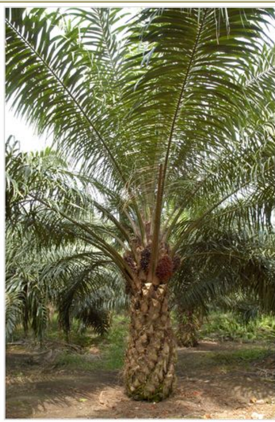
Figure 2. Oil palms can be an excellent source of oil for biodiesel when grown on previously degraded land. On the other hand, palm plantations established on newly cleared tropical forests result in loss of biodiversity from one of the world's hot spots of diversity and huge emissions of greenhouse gases, especially when grown on peat soils as is practiced in much of Southeast Asia.

A major criticism of the life-cycle analysis approaches described above is that they do not include indirect effects associated with the scaling up of production. There are multiple indirect effects of increased biofuels production, and researchers are only starting to unfold those effects and measure their environmental implications (Chapter 14). One of the greatest concerns is the effect of indirect land-use change on emission of greenhouse gases. The rapidly growing production of biofuels requires additional cropland. In some cases, this additional land comes from agricultural land previously used to grow food or feed crops. In a hungry world, these diverted crops must be made up elsewhere, thus driving land conversion—perhaps in different countries and on different continents – to compensate for the loss of food-crop production. Additional land for food and feed production usually comes from the conversion of native ecosystems such as grasslands, savannahs, and forests, or by returning permanent fallow or abandoned croplands to production. These land conversions can have a substantial impact on the greenhouse-gas balances of biofuels. In general, when biofuel cropping is associated with the conversion of native ecosystems (particularly forests, and especially peat land), the net greenhouse-gas balance is negative,