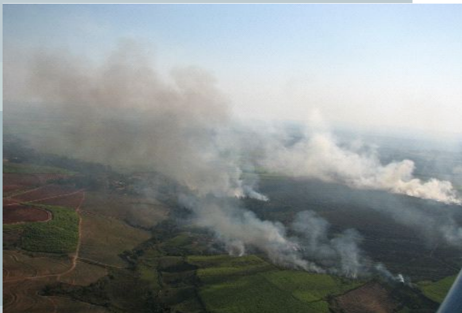
Figure 3. In Brazil, air pollution is severely affected from ethanol production, particularly from the burning of sugar cane before manual harvest. Acid rain is occurring as a result.

Local and regional air pollution: The use of ethanol and biodiesel as fuels or as fuel additives to fossil fuels can reduce the emissions of some pollutants from vehicle exhaust such as fine particles and carbon monoxide, but tends to increase other pollutant emissions such as nitrogen gases (Chapters 1 and 10). One of the largest sources of air pollution from biofuel production comes from the practice of burning sugarcane before harvest. The resulting smoke, fine particles, and nitrogen gases in the atmosphere cause acid rain and contribute to a variety of human health impacts (Figure 3). Burning as a practice is used to facilitate the cut of sugarcane stalks by manual harvesting and to reduce the risk to harvesters of being bitten by snakes, and can be avoided if mechanical harvesting equipment is used. However, manual harvesting remains dominant, and most sugarcane fields are burned before